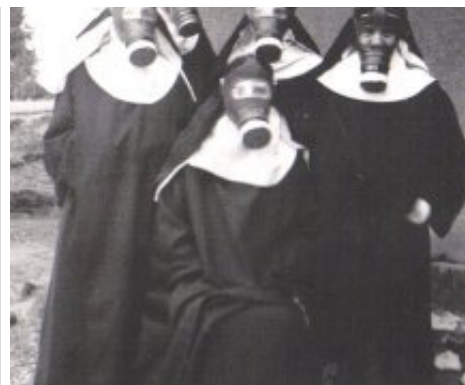
The nuns in gas masks 1939

6th September At Chapter today Lady Abbess added to her instructions a warning to be very careful on two points especially. To observe all the rules for blacking out, and to avoid waste of any kind. Not only are prices going up, but many things are almost impossible to get as Government has taken over a number of the factories. She concluded by urging us all to keep calm, as anything like nerves would make life very trying not only for the nervy one but for everybody else.