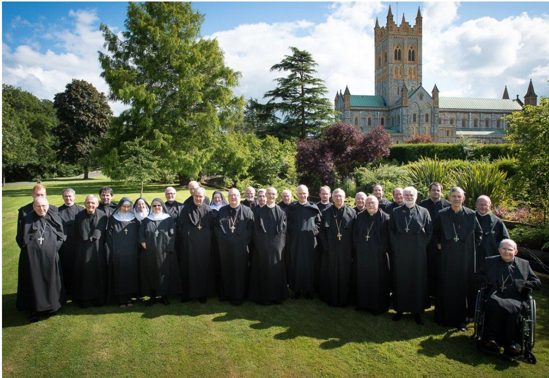
General Chapter at Buckfast Abbey